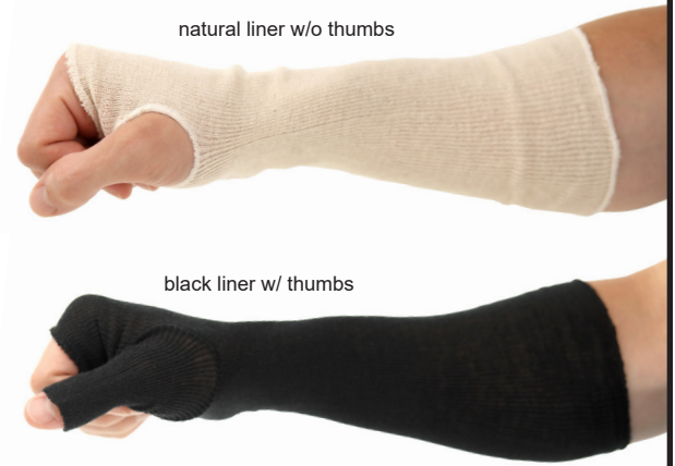
natural liner w/o thumbs