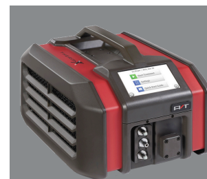
Therm-X AT Unit TX0002