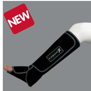
Half Leg Boot TX0111