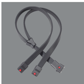
Split Umbilical Hose TX0208