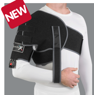
Shoulder/XL Shoulder TX0101/TX0110

Therm-X® garments are bilateral so you don't have to buy lefts and rights. They're one size fits all , and have high-end Velcro to last the life of the garment. The inner face uses a ripstop nylon with a waterproof backing to prevent buildup of mold and mildew after cleaning.