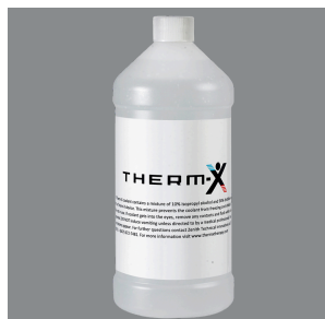
1 Qt Coolant TX0206