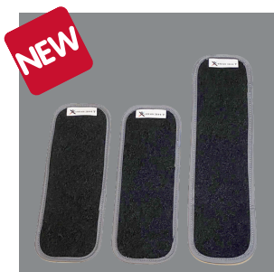
Extender Straps TX0109