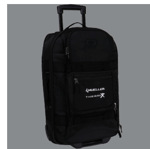
Carry Case TX0202