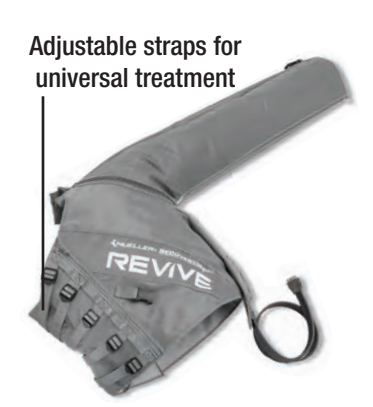
Revive™ Half Jacket (OSFM)