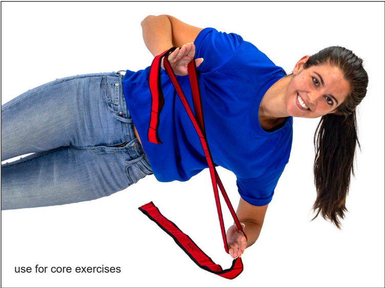
use for core exercises