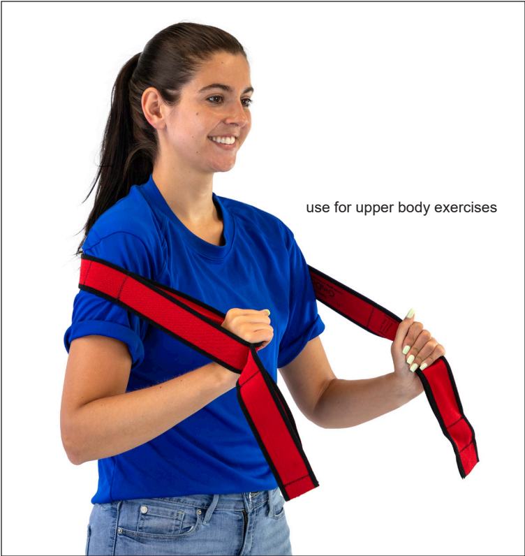
use for upper body exercises