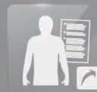
Assign Shortcut 4